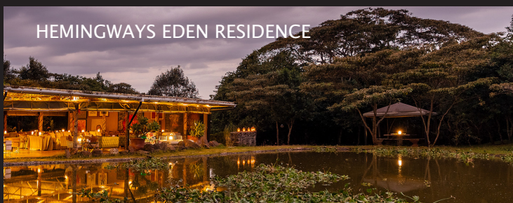
HEMINGWAYS EDEN RESIDENCE